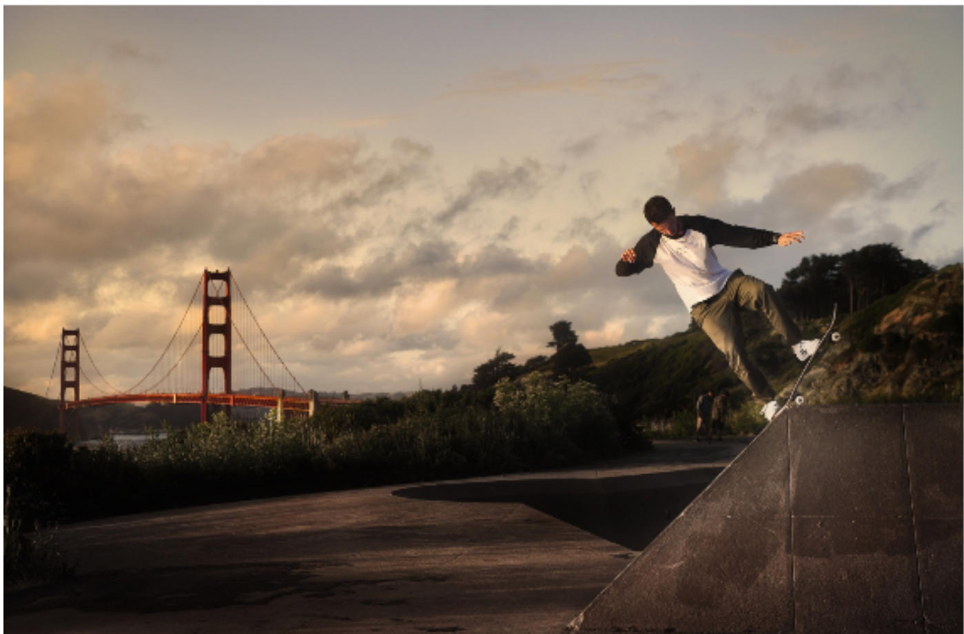
San Francisco - California