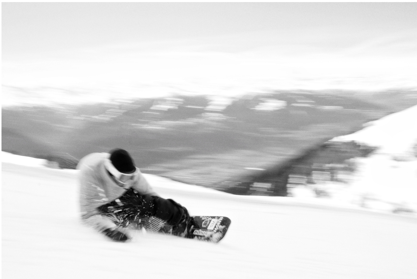
Crans-Montana - Suisse