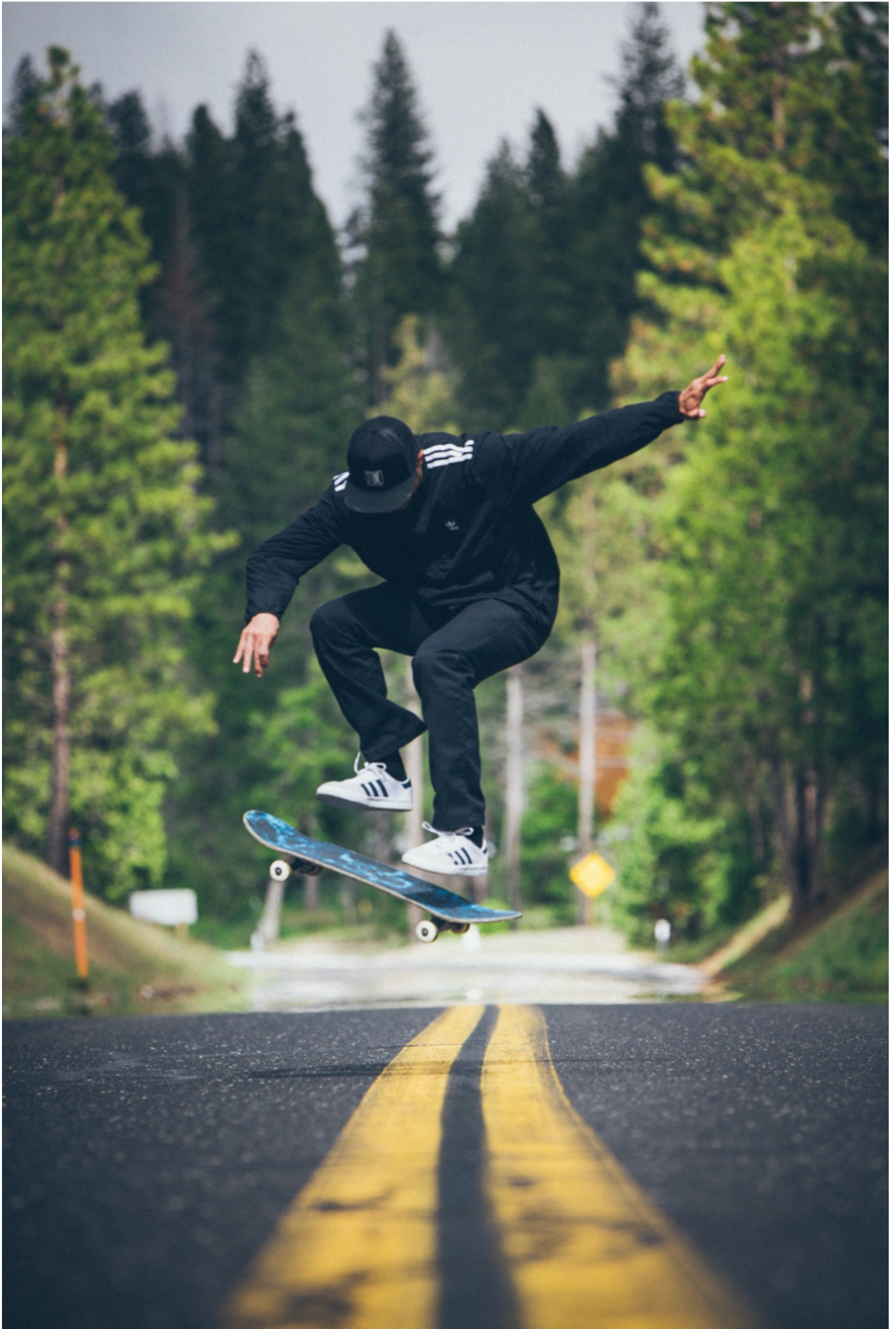
Yosemite - California