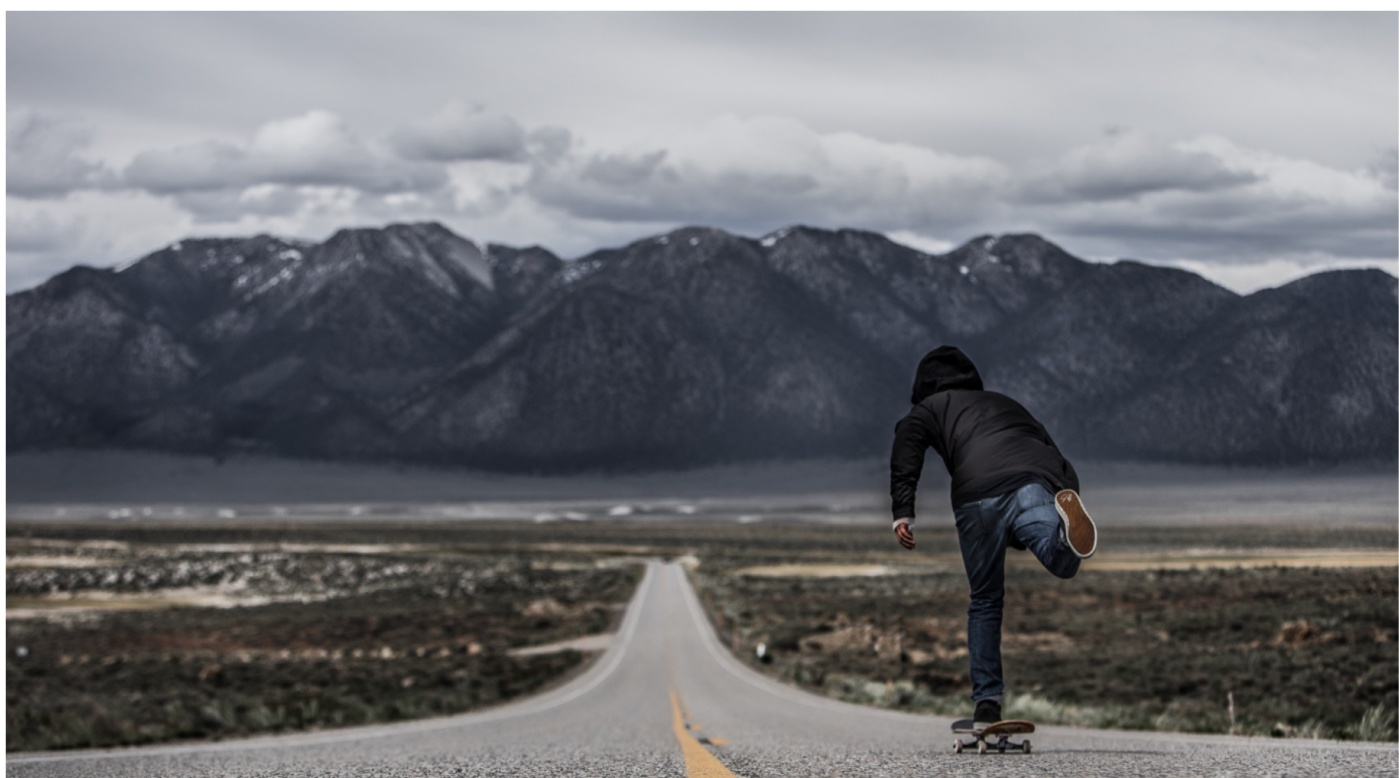
Mammoth Mountain - California