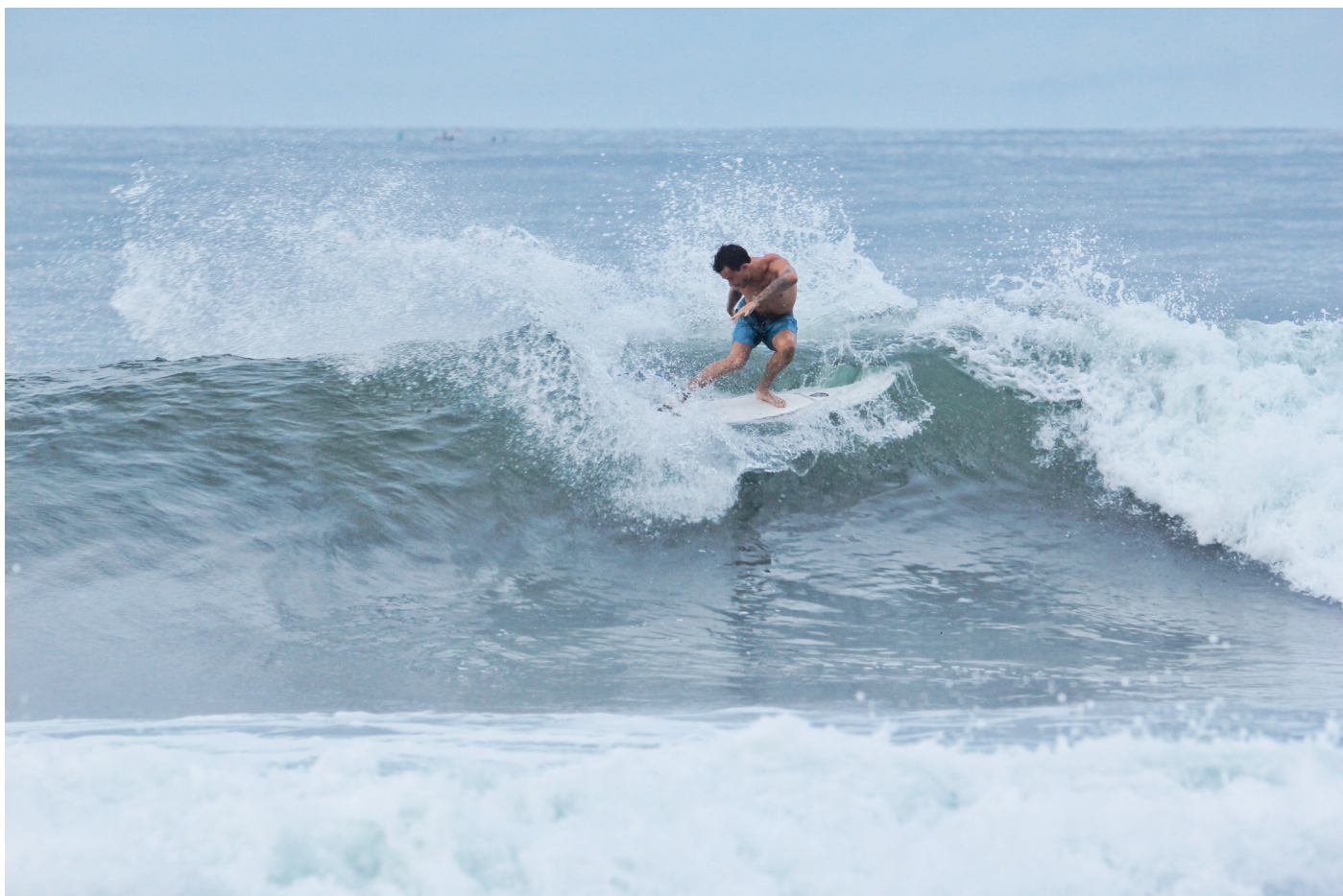
Punta Mango - Salvador