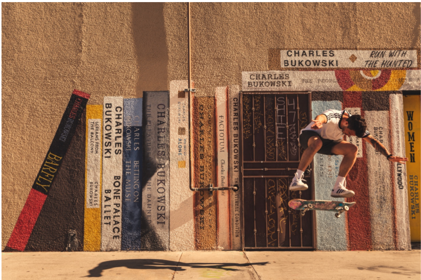
Los Angeles - California