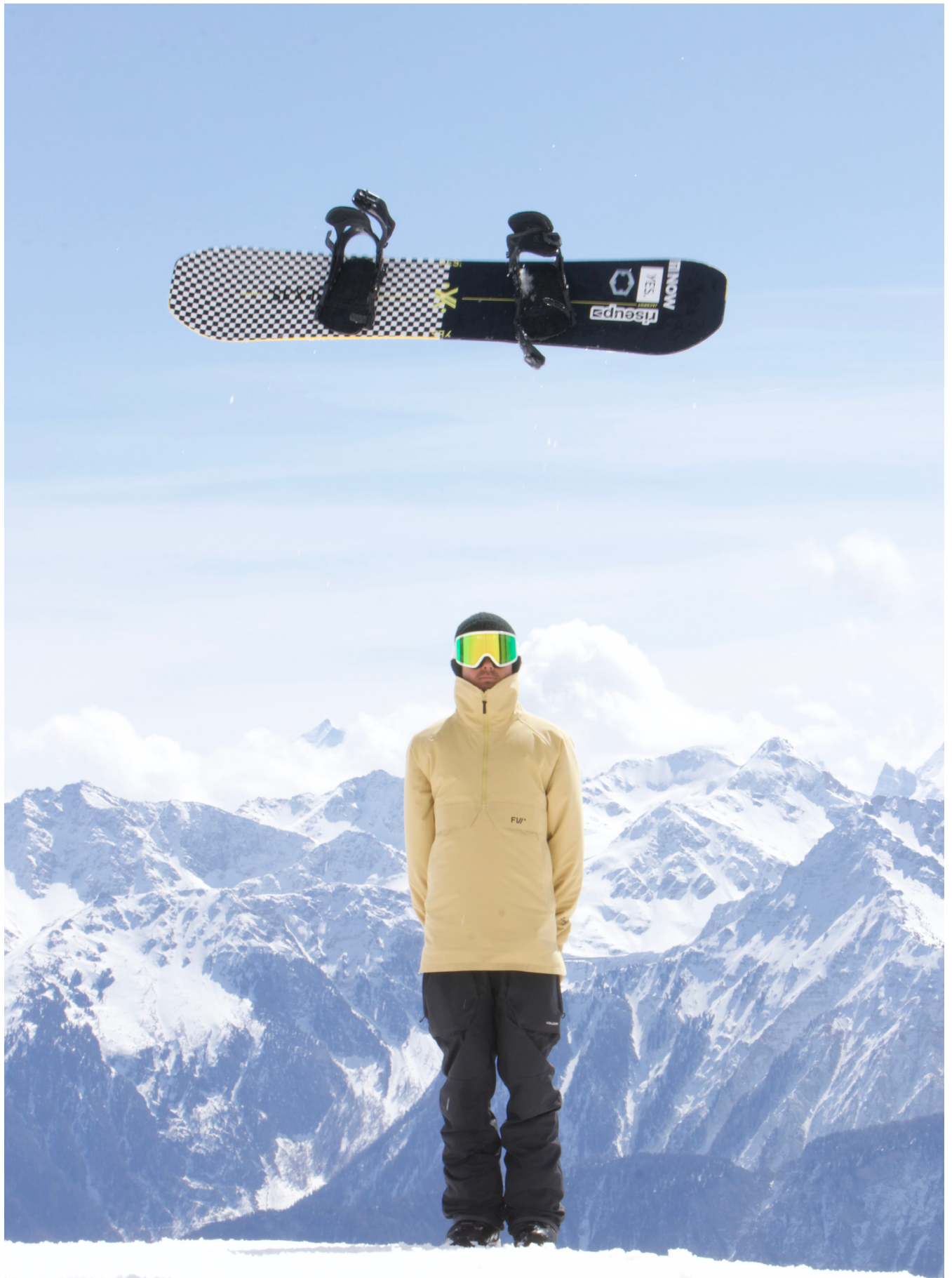
Crans-Montana - Suisse