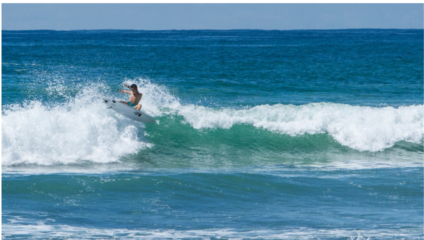
Midigama – Sri Lanka