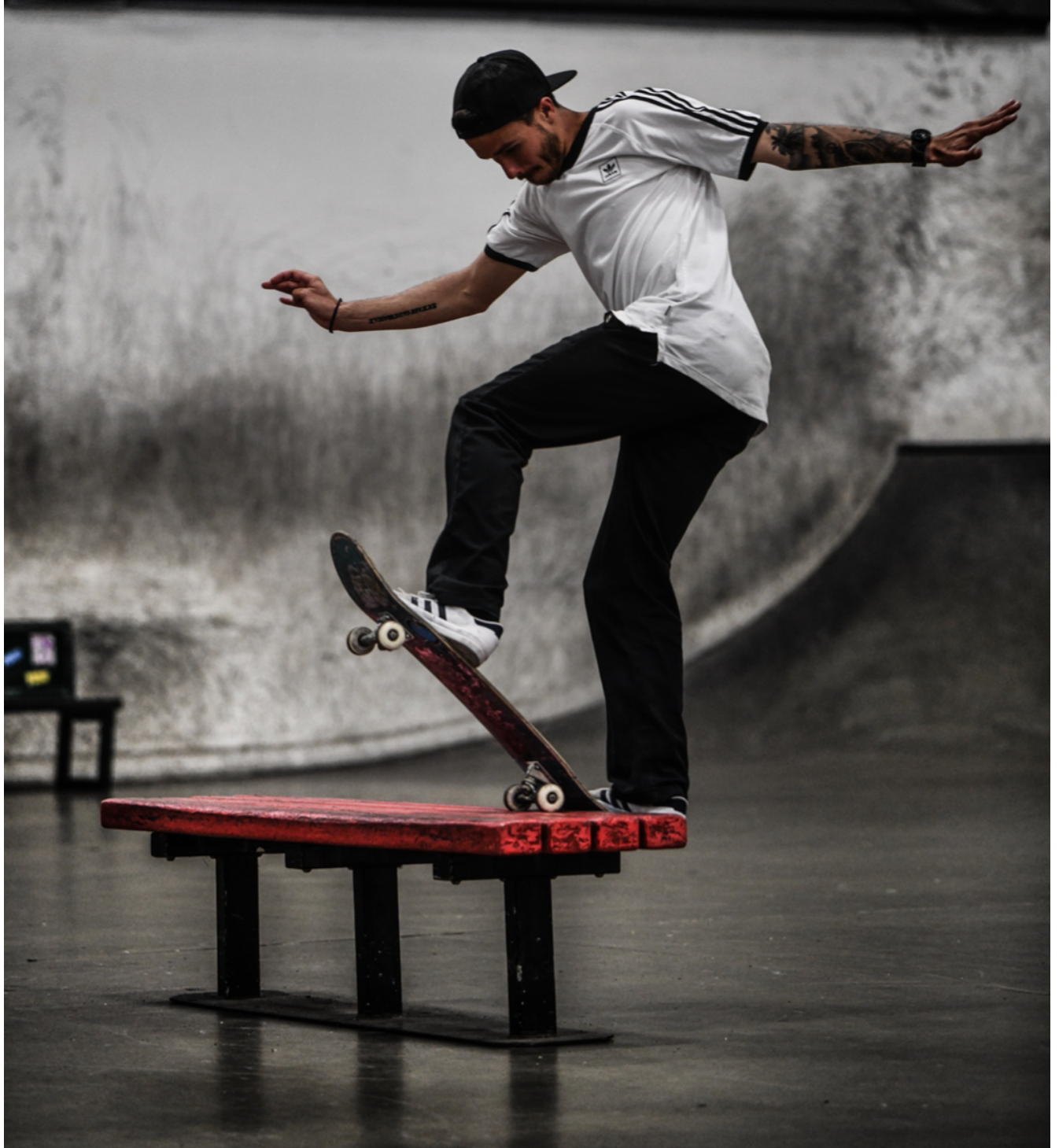
The Berrics - California