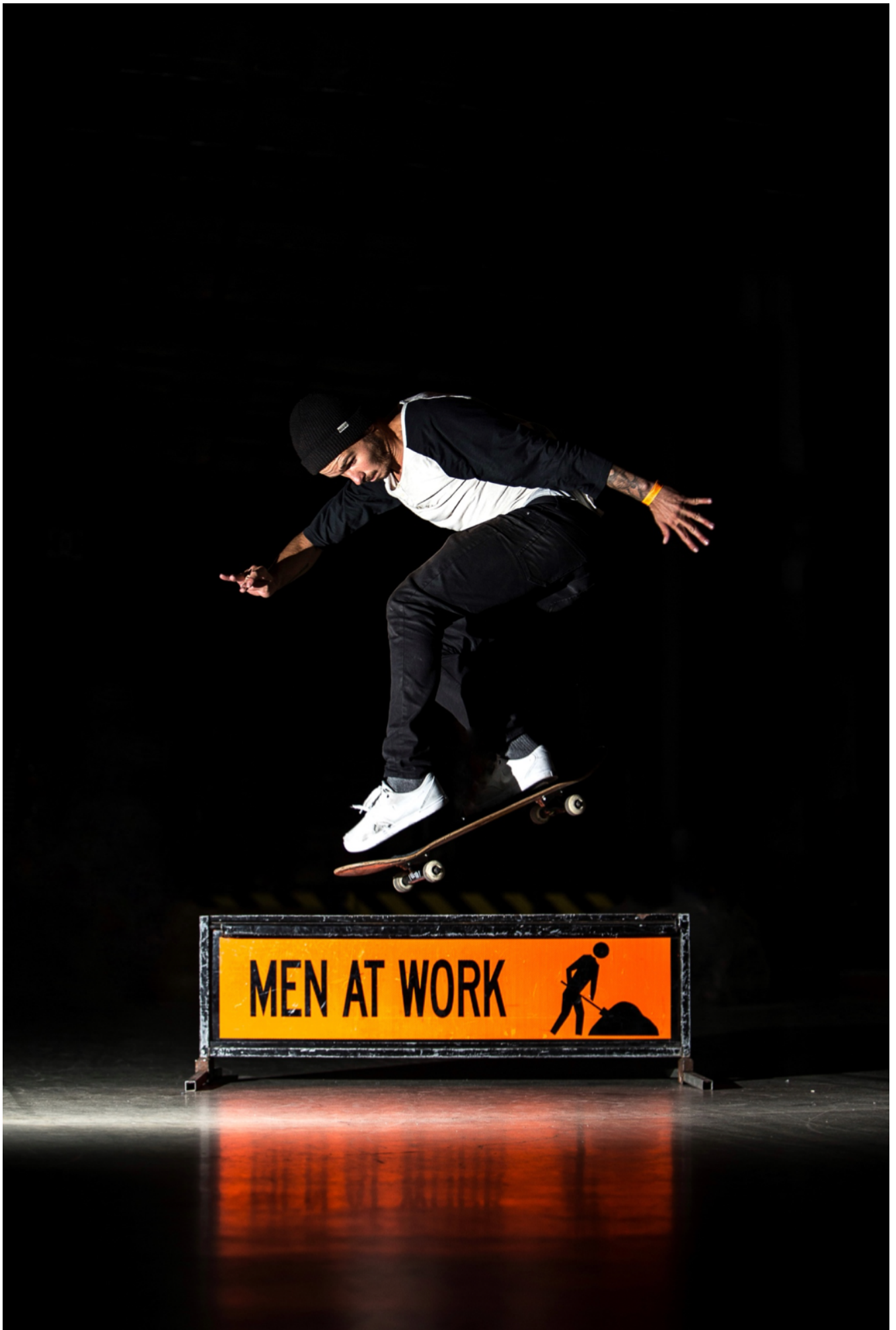
Huntington Beach - California