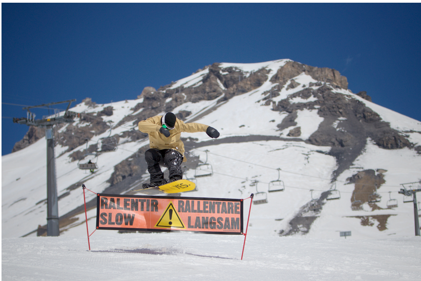
Crans-Montana - Suisse