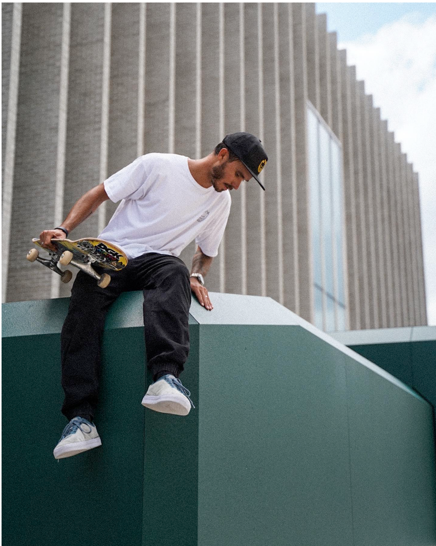
Lausanne - Switzerland