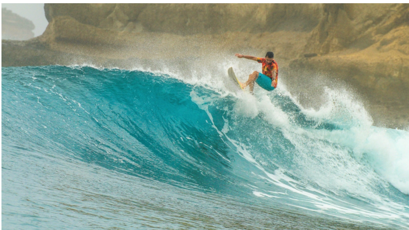
Lombok - Indonesia