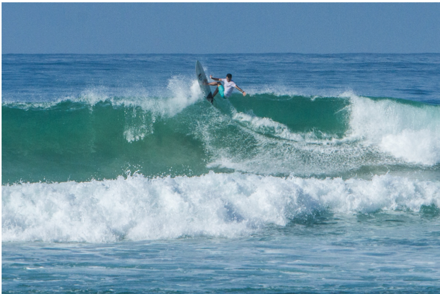
Midigama - Sri Lanka