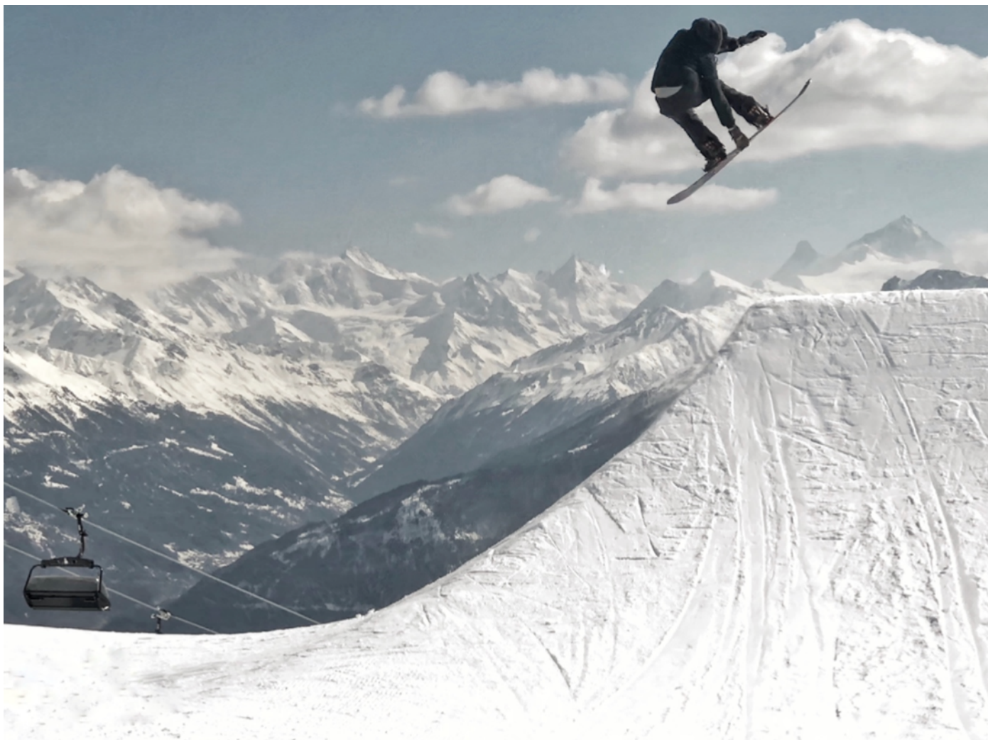
Crans Montana - Switzerland