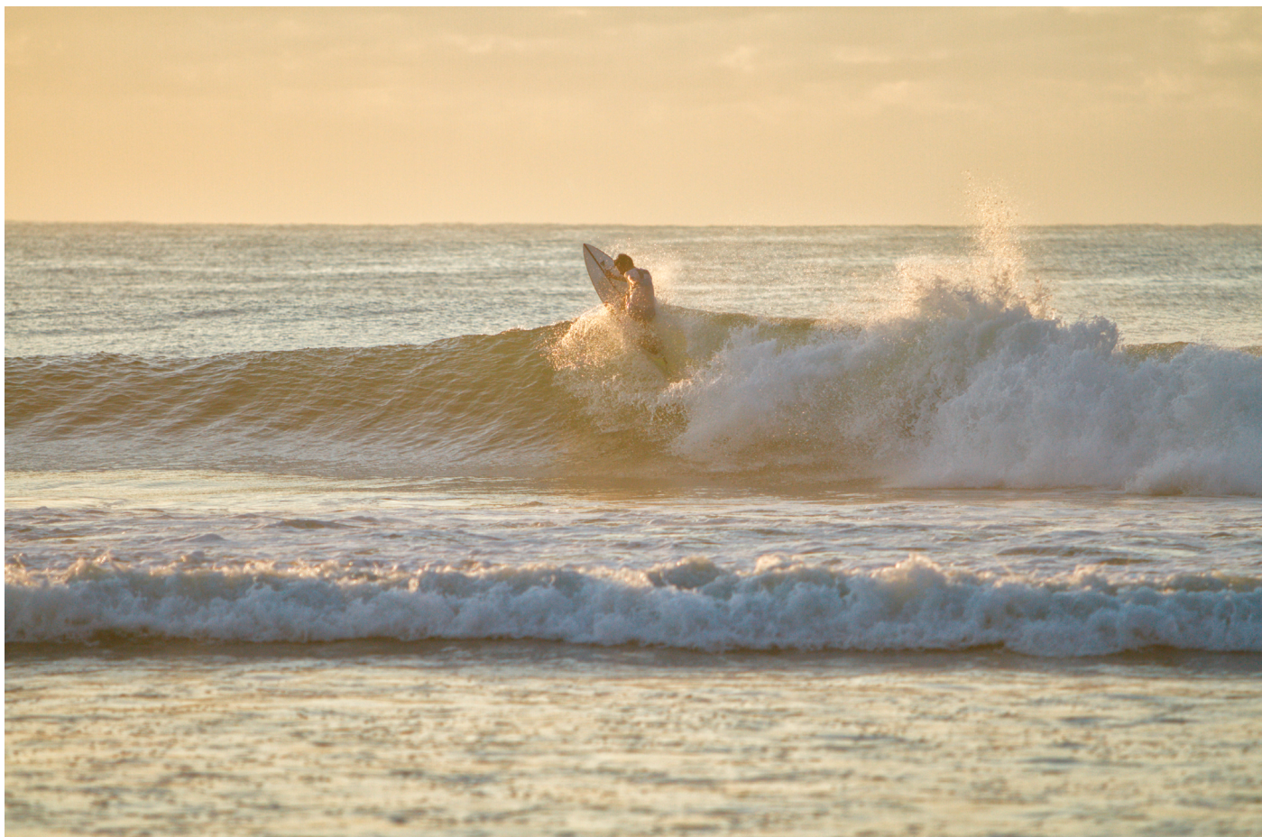
Barra de la Cruz - Mexique