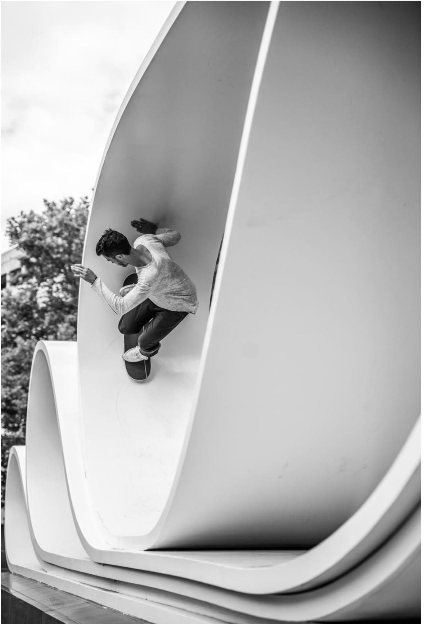
Melbourne - Australia