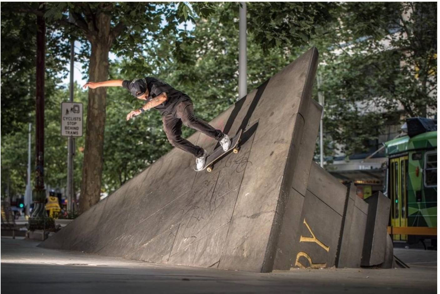
Melbourne - Australia