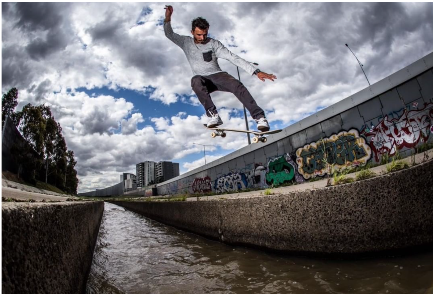
Melbourne - Australia