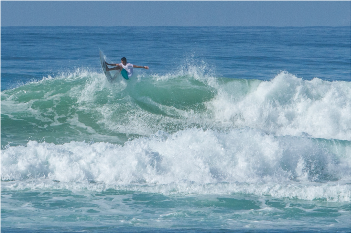
Midigama – Sri Lanka