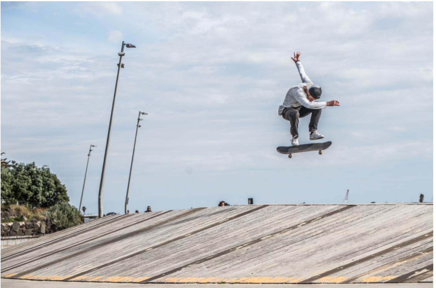
Saint Kilda - Australia