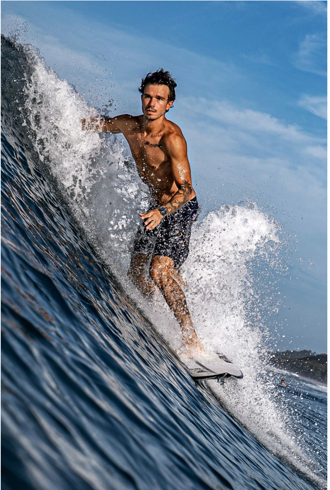
Santa Teresa - Costa Rica