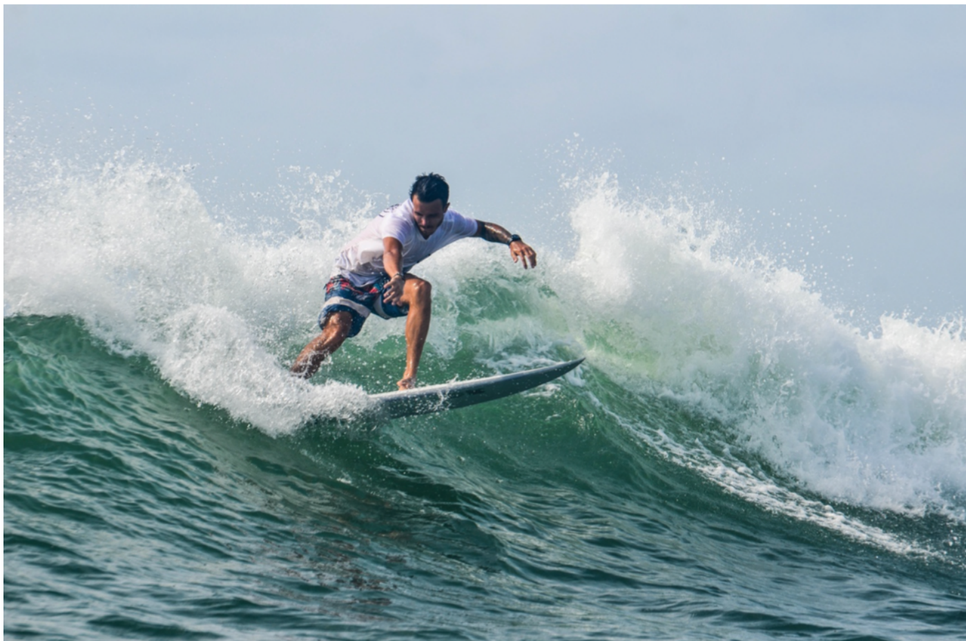
Fisherman Bay – Sri Lanka