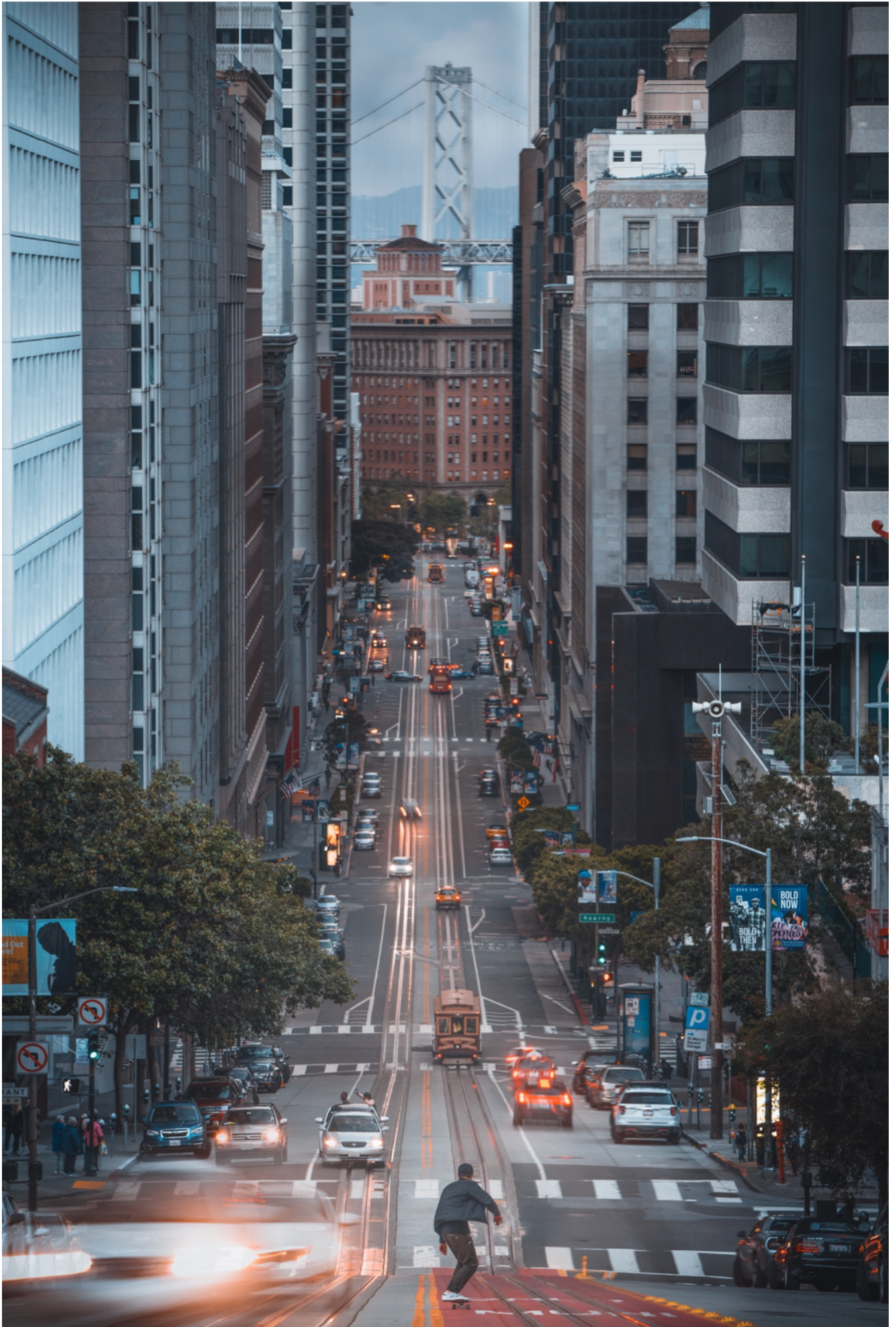
San Francisco - California