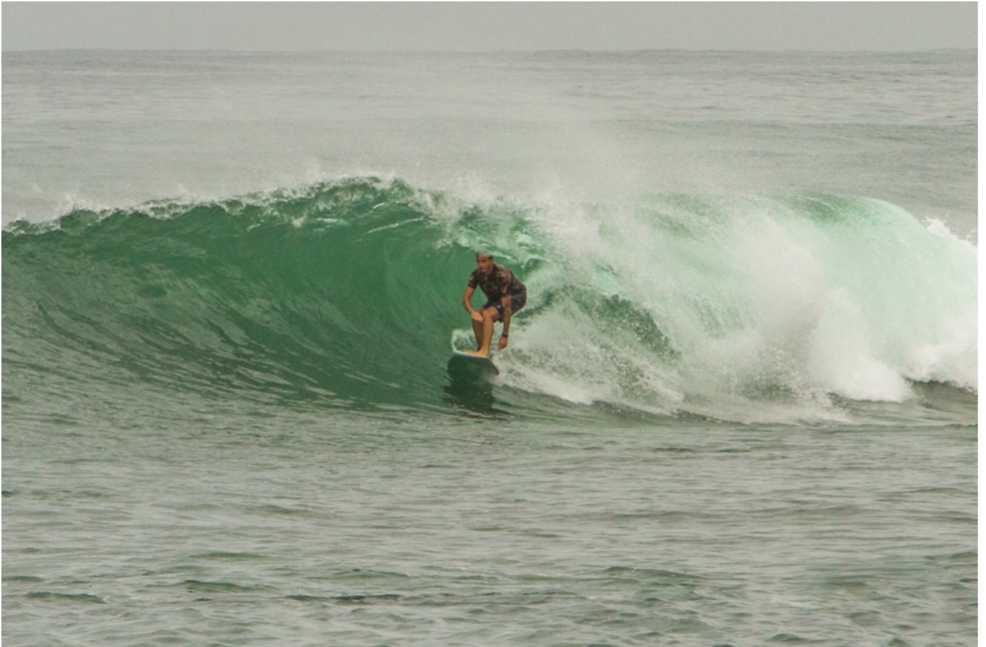
Matara – Sri Lanka