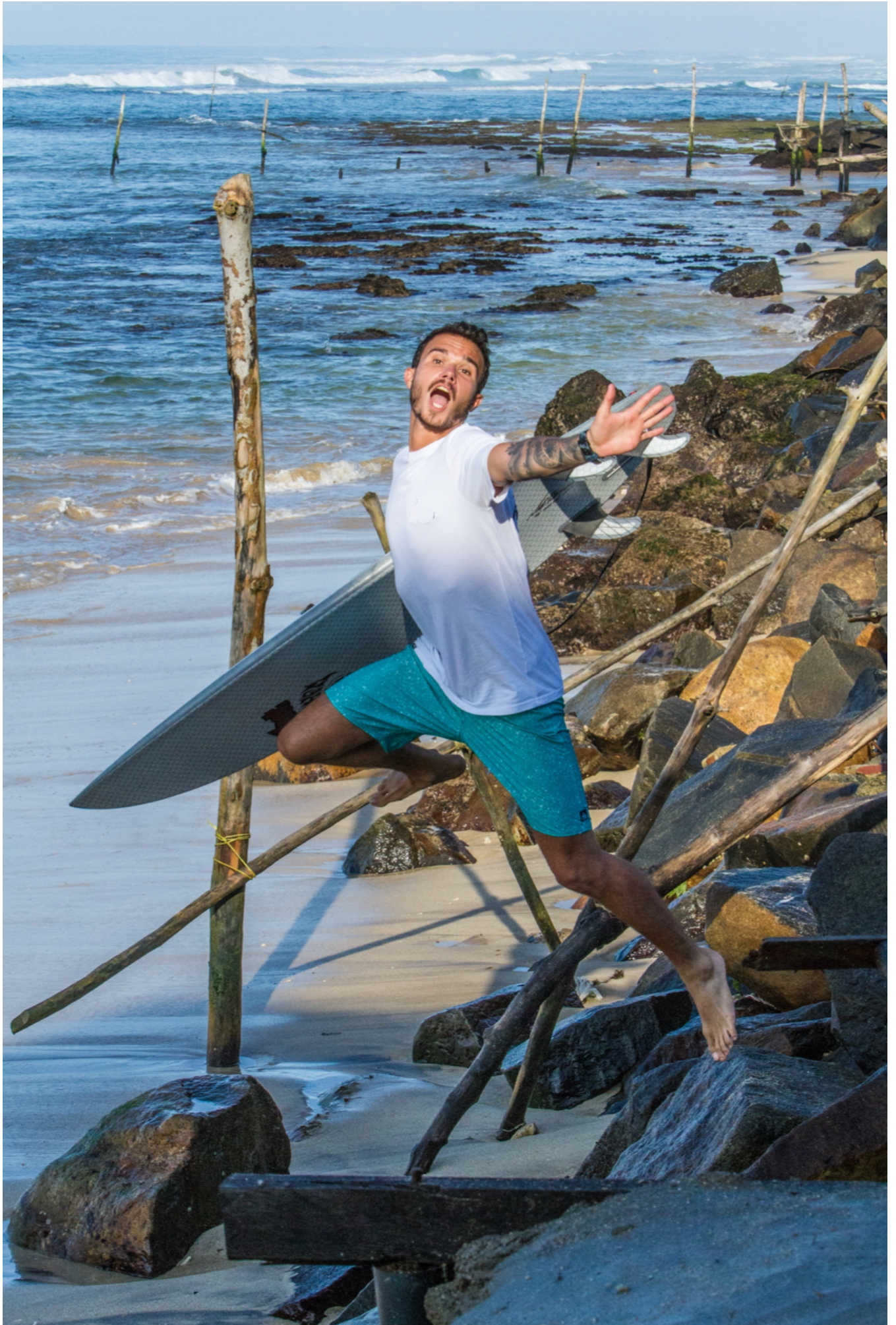
Midigama – Sri Lanka