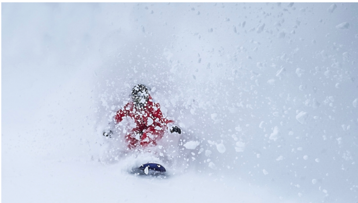
Verbier - Switzerland