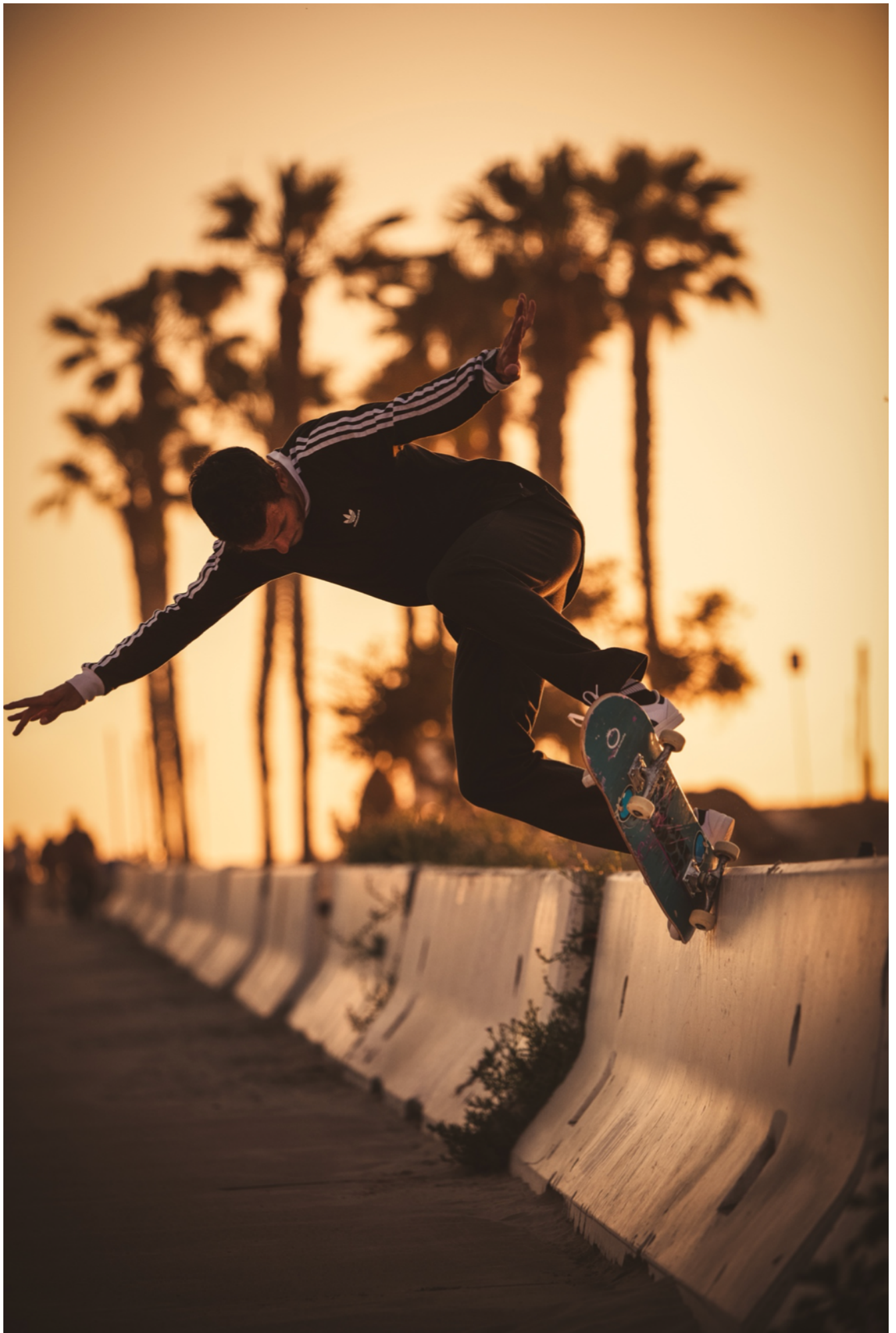
Huntington Beach - California