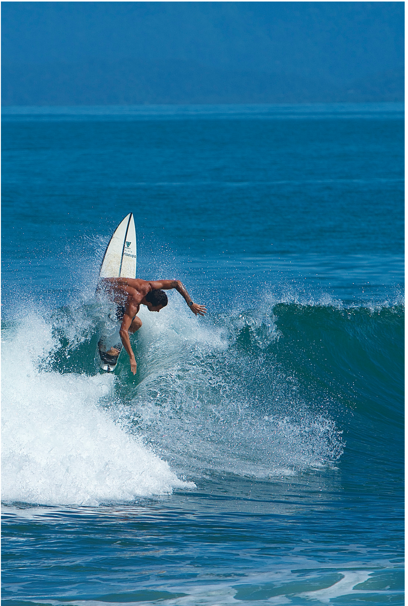
Pavones - Costa Rica